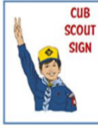
CUB SCOUT SIGN