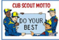
CUB SCOUT MOTTO DO YOUR BEST

SCOUT OATH On my honor I will do my best to do my duty to God and my country and to obey the Scout Law; to help other people at all times; to keep myself physically strong, mentally awake, and morally straight.