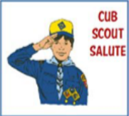
CUB SCOUT SALUTE

SCOUT OATH On my honor I will do my best to do my duty to God and my country and to obey the Scout Law; to help other people at all times; to keep myself physically strong, mentally awake, and morally straight.